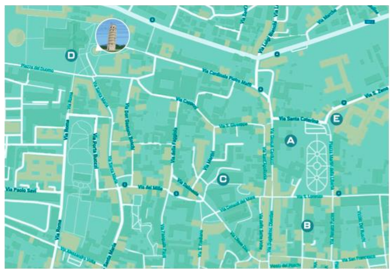
The longest walking distance between two locations is 7'