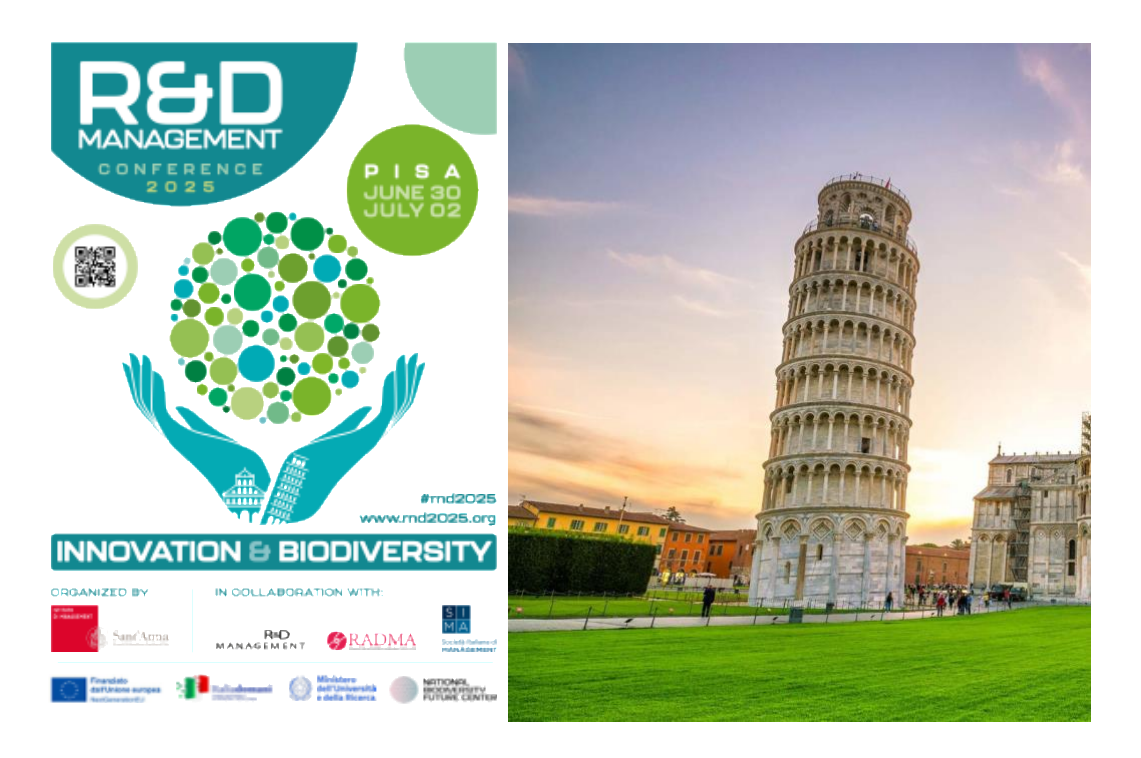
Version of June 23, 2025

Welcome to Pisa for the R&D Management Conference! We really hope you will have a wonderful time. In this document, you will find information which will help you enjoy all the scheduled events. The conference will take place in different locations in the city centre but you can easily walk to them.